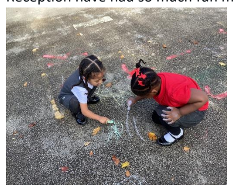
Reception have had so much fun making patterns and shapes with chalk. Good job it washes off!

Thank you to all the Reception parents, who attended our Welcome Service on Friday.